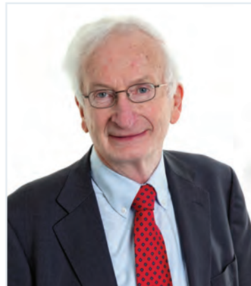
Jim O'Keeffe Former member of Dáil Éireann